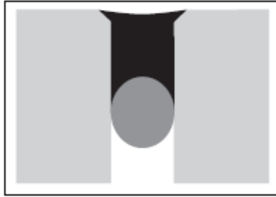
The flush joint design rules out trip hazards and dirt traps.